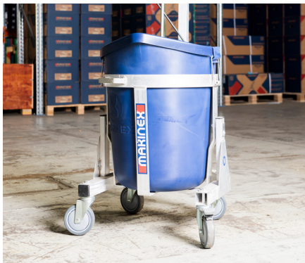
1. Mixing Station MS100