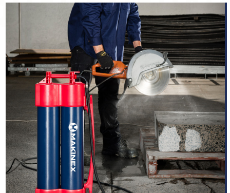
3. Connects with Coring and Cutting Tools