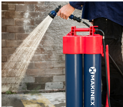
2. Constant Water Flow