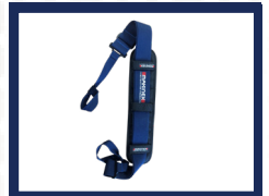
6. Shoulder Strap attachment