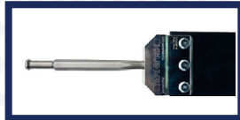
3. Tile Smasher Head with Hilti HEX Shank Combo V2 TSHC-HS-US-V2