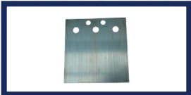
6. Tile Smasher Blade TSH-B