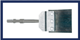
1. Tile Smasher Head with 30mm HEX Shank Combo V2 TSHC-SS-AU-V2