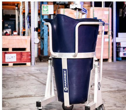
2. Mixing Station MS150