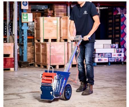
3. Floor Stripper