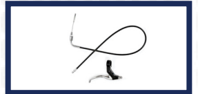
5. Brake Lever and Cable JHT-99-63-V2