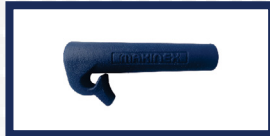
4. Handle Grips MAK-UP-10-V2