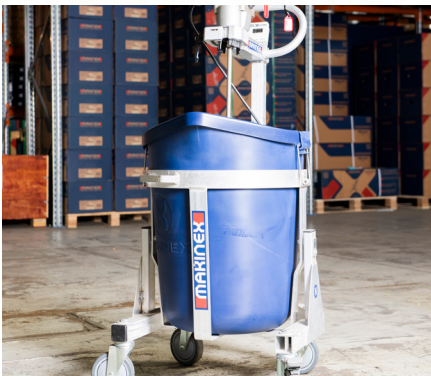
1. Mixing Station MS100