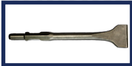
2. Flippable Wide Chisel WCAU-404