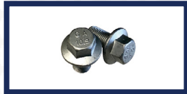
8. Tile Smasher Head Bolts TSH-BS-V2