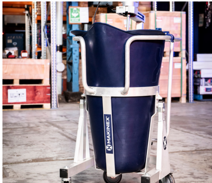
2. Mixing Station MS150