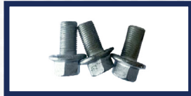
9. Tile Smasher Attachment Bolts TSH-BS-V2-KIT