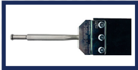
2. Tile Smasher Head with Hilti HEX Shank Combo V2 TSHC-HS-US-V2