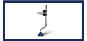
10. Vacuum Attachment JHT-VA-01-00