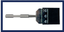
1. Tile Smasher Head with 1 1/8-inch HEX Shank Combo V2 TSHC-SS-US-V2