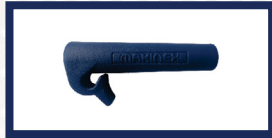
4. Handle Grips MAK-UP-10-V2