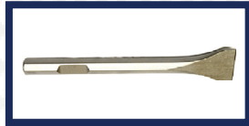
3. Flippable Wide Chisel WCUS-420