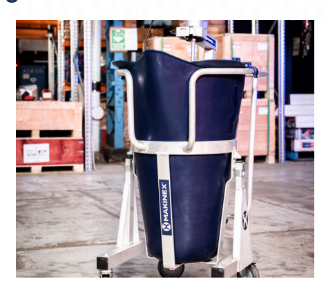
2. Mixing Station MS150