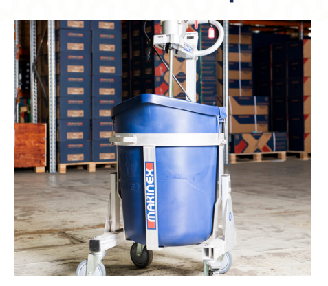
1. Mixing Station MS100