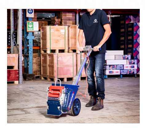
3. Floor Stripper