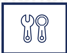
7. Two sets of Quick Couplers