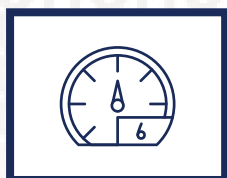
6. 6.3 km/h Travel Speed