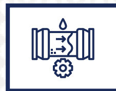
5. 48 L/min Hydraulic Flow