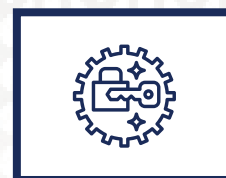
10. Easy access to all Engine Components