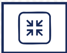
2. Compact 890mm Width