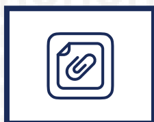
8. Wide selection of Attachments