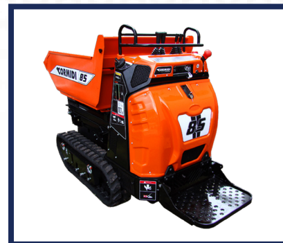
3. Cormidi C85