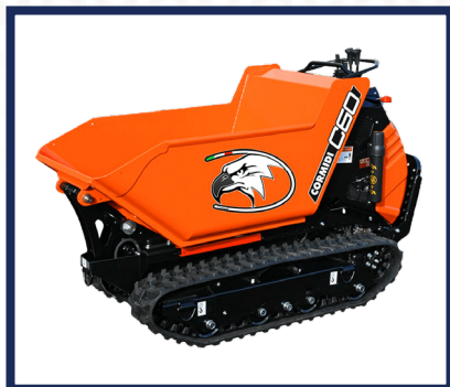
2. Cormidi C60