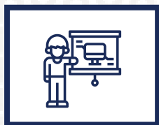
1. Stand-On Operator Platform