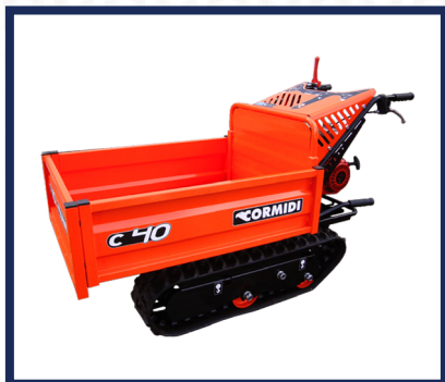
1. Cormidi C40