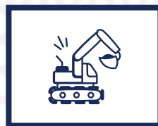
4. 1 Tonne Tipping Capacity