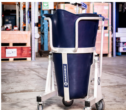
1. Mixing Station MS150