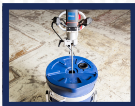
1. Removable dust splash and bucket