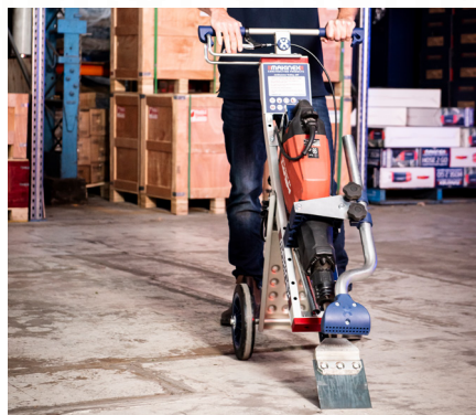
2. Jackhammer Trolley