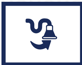
2. Universal Vacuum Port