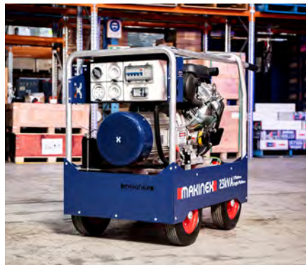
2. Power Generator 23 kVA