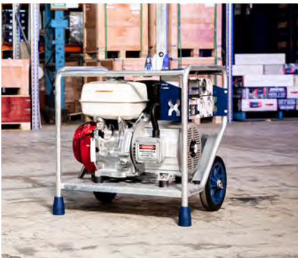
1. Power Generator 10 kVA