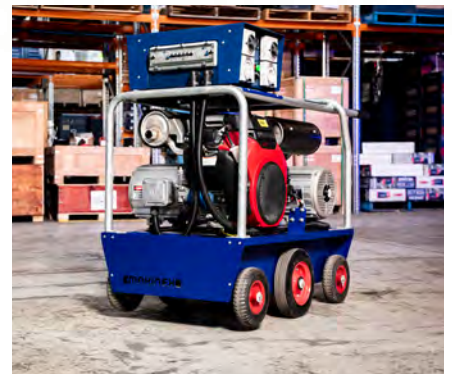
3. Power Generator 32 kVA