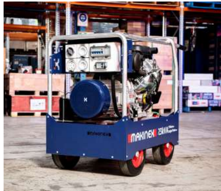
2. Power Generator 23 kVA