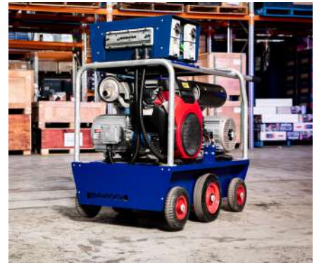
3. Power Generator 32 kVA