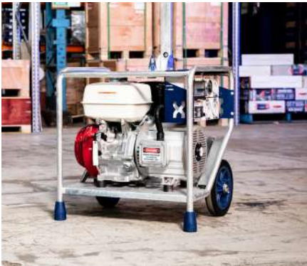
1. Power Generator 10 kVA