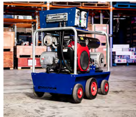
3. Power Generator 32 kVA