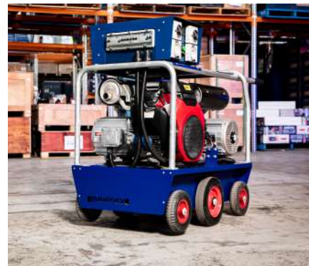
3. Power Generator 32 kVA