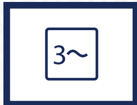
3. 1x 32 A Three phase socket