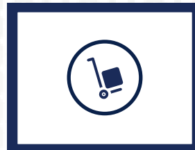
5. Easy Manoeuvrability