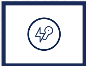
1. Electric/Key Start