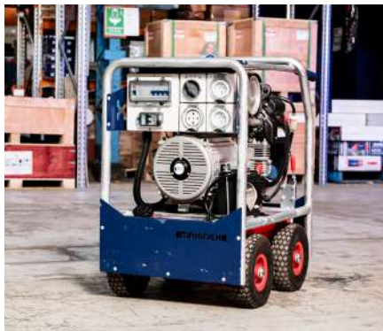
2. Power Generator 16 kVA