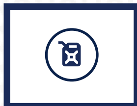
4. 50L Fuel Tank