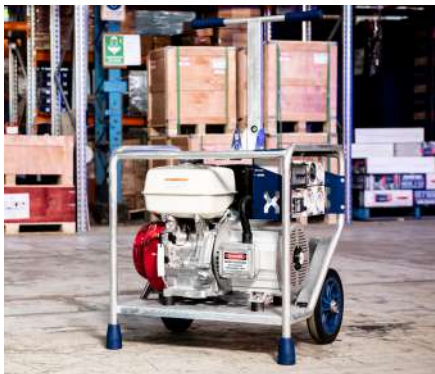
1. Power Generator 10 kVA