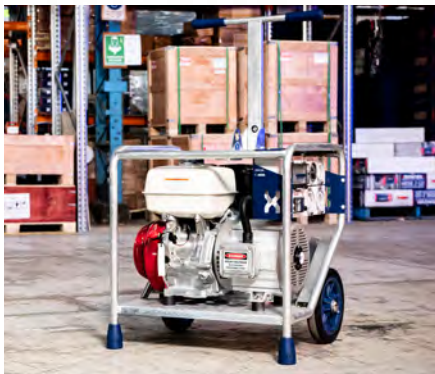
1. Power Generator 10 kVA