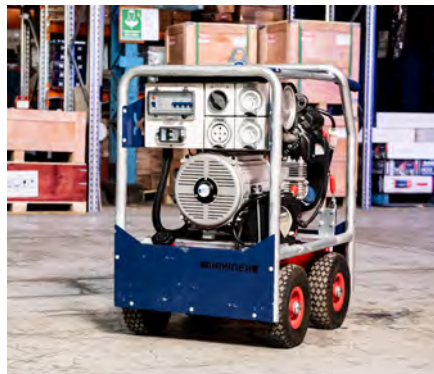
2. Power Generator 16 kVA