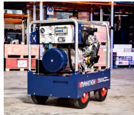
3. Power Generator 23 kVA