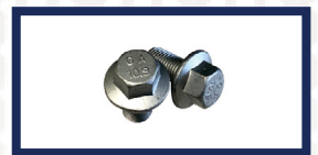
5. Tile Smasher Head Bolts TSH-BS-V2