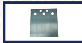
4. Tile Smasher Blade TSH-B