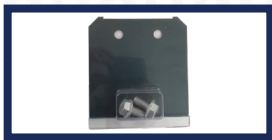
7. SDS Blade and Bolt Kit TSH-SDS-B-KIT