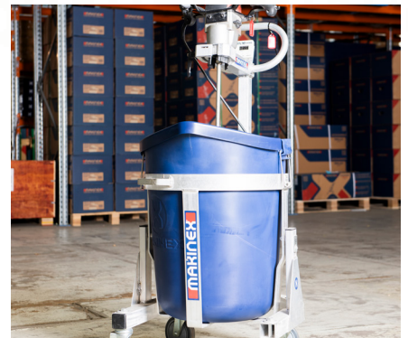
3. Mixing Station MS100