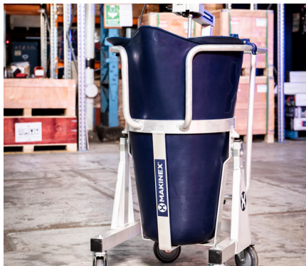
2. Mixing Station MS150