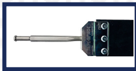
3. Tile Smasher Head with Hilti HEX Shank Combo V2 TSHC-HS-US-V2