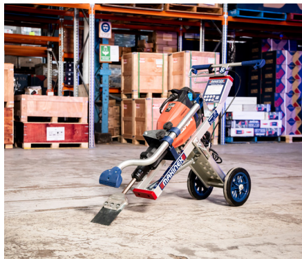
1. Jackhammer Trolley