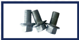
6. Tile Smasher Attachment Bolts TSH-BS-V2-KIT