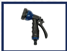
1. Spray Gun