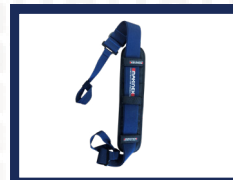
6. Strap attachment