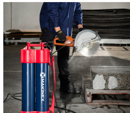
3. Connects with Coring and Cutting Tools