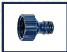
4. Screw on quick connect hose fitting