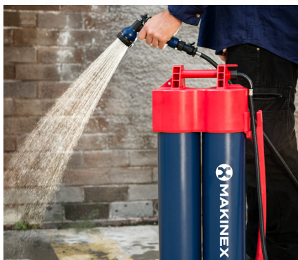
2. Constant Water Flow