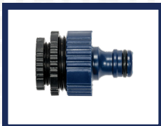
3. Tap Adaptor