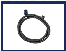
2. Hose 3m