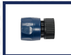
5. Quick connect stop valve hose fitting