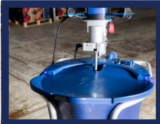
1. Removable dust splash and bucket