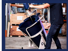
5. Easy tilt operation for precision pouring