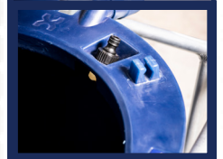
6. Hose Connector