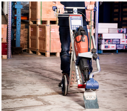
2. Jackhammer Trolley