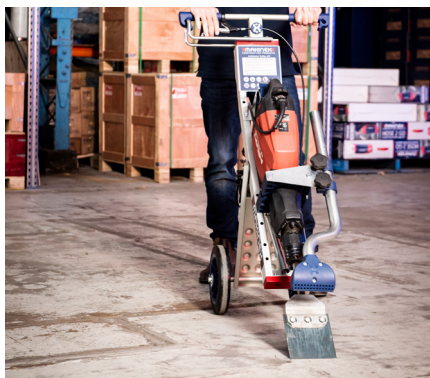
2. Jackhammer Trolley