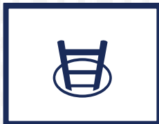
3. Large Inspection Holes