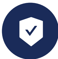
Safe and Compliant Storage (AS/NZS 3190 and AS/NZS 3012 as a Portable Socket Outlet Assembly (PSOA))