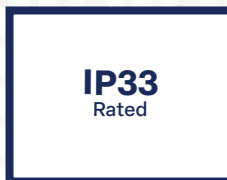
4. IP33 Rated