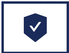
1. 6x Secure Lockers