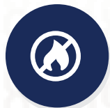
Fire Retardant Design