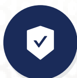
Protected GPO for each Locker

Redefining on-site battery storage and charging. The Mobile Charge Pod offers a safe haven for your power products, providing a simple and organized solution for contractors and tradespeople. With 6 easy-to-use lockers accommodating various tool and battery types, it's a fire-resistant design crafted by and for Tier 1 Contractors that will relieve stress from equipment loss and battery downtime. Lightweight yet robust, it surpasses metal lockers, with forklift pockets for transportation convenience.