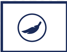
2. Lightweight and Portable