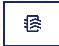
6. Air Ventilation