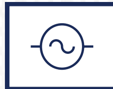
5. Single 15A supply