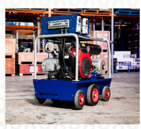
3. Power Generator 32 kW