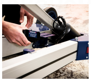
1. Battery Powered