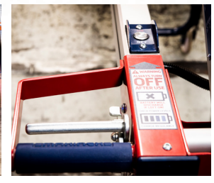
3. Hand Brake and Button Start